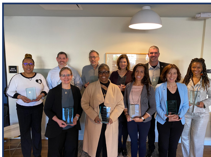
Cohort Two Leadership Academy Graduates, Jan. 2023