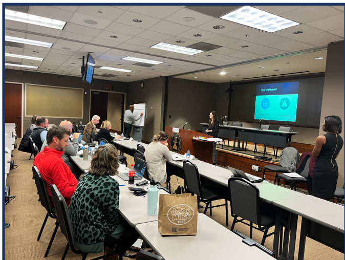
Strategic Planning 201, Jan. 2023