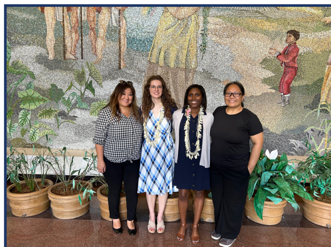
HI Focus Group Facilitation, June 2023