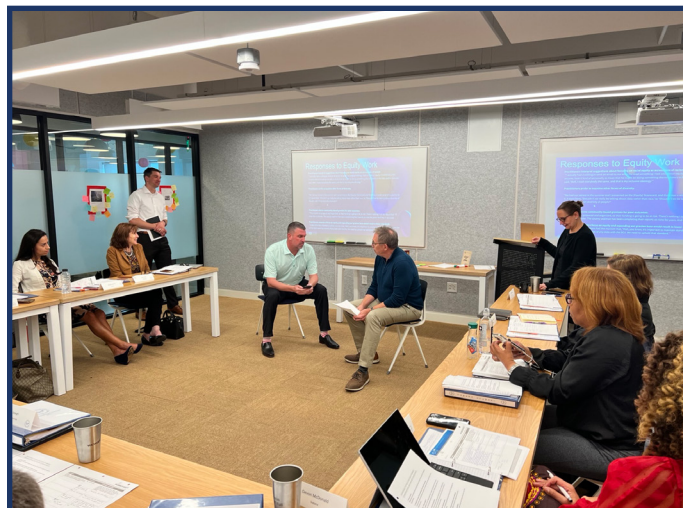
Equity Leadership Academy Session, Nov. 2022