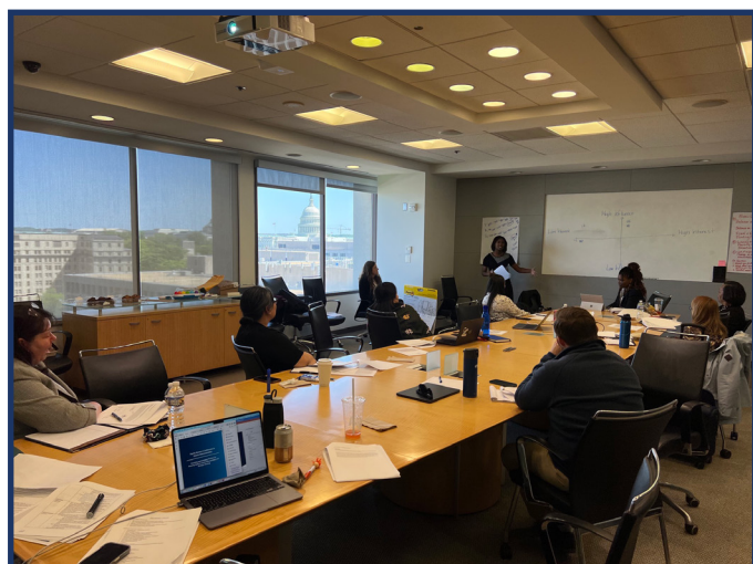
Strategic Planning Crash Course, April 2023